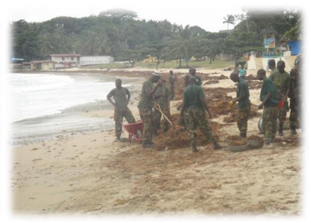
Figure 2: Recent invasion of Sargassum in Côte d'Ivoire and in Sierra Leone.